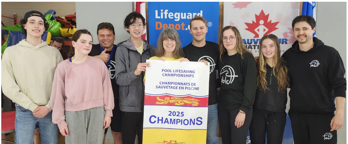
2025 Pool Lifesaving Championships winner, Dieppe Aquatic and Sports Centre

Happy Easter! The Lifesaving Society's office will close Friday, April 18 and Monday, April 21 for Easter weekend. We reopen Tuesday, April 22 at 9:00 a.m.